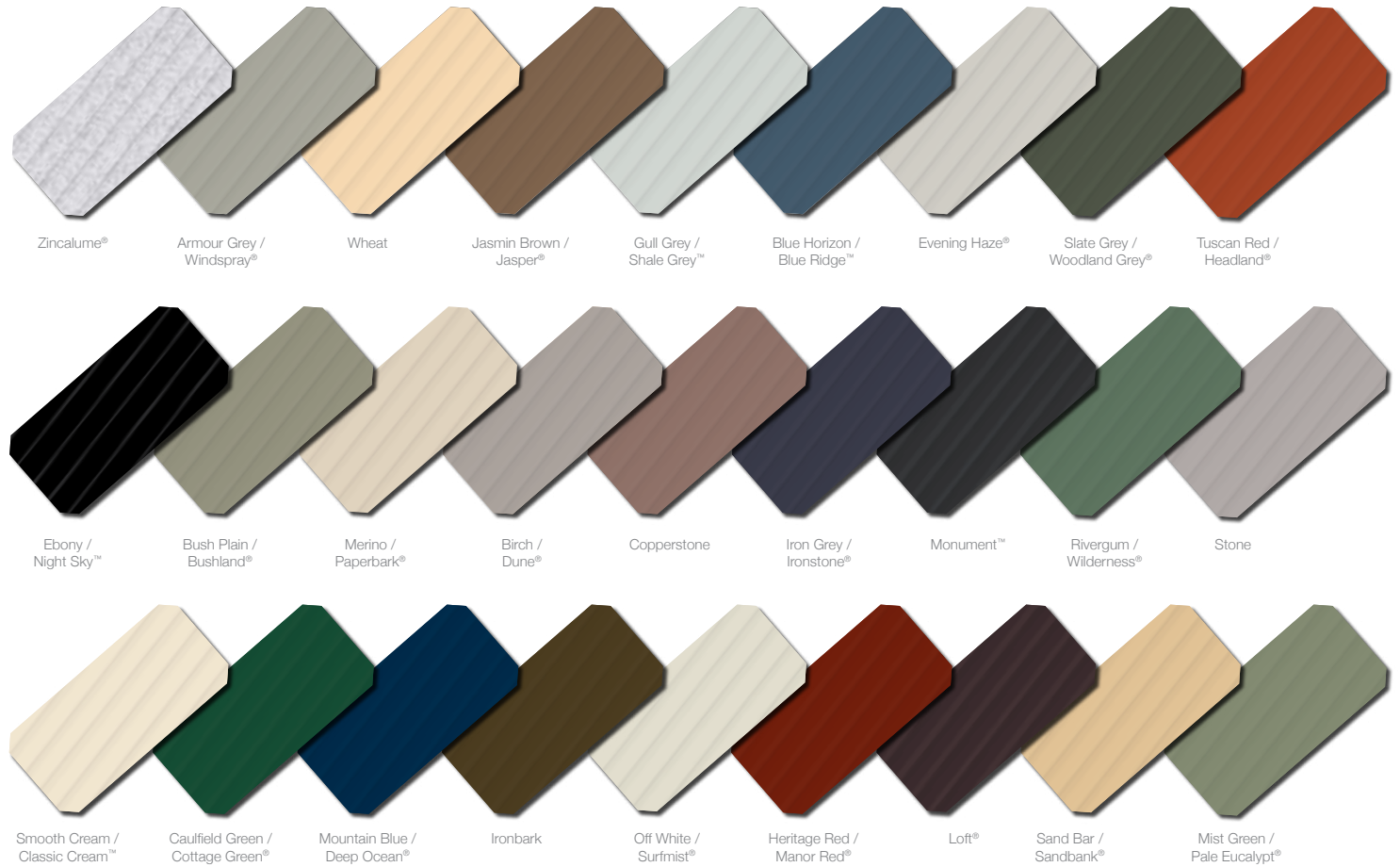
55. Standard Roller Door Colours